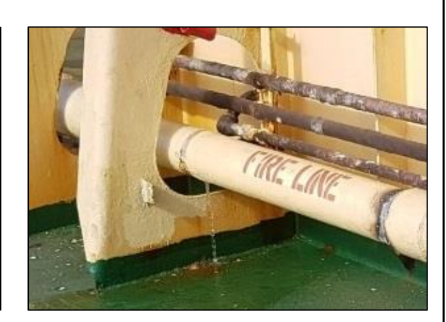
Leakage from fire main