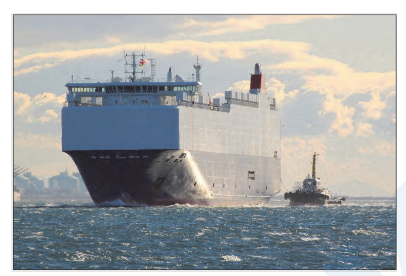
Figure 4 Large vehicle carrier