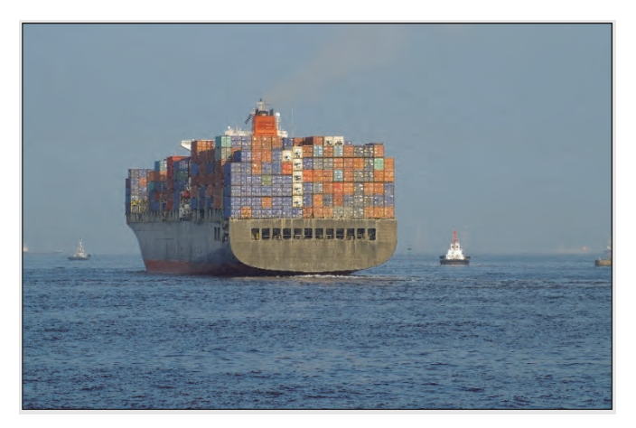
Figure 1 Container carrier