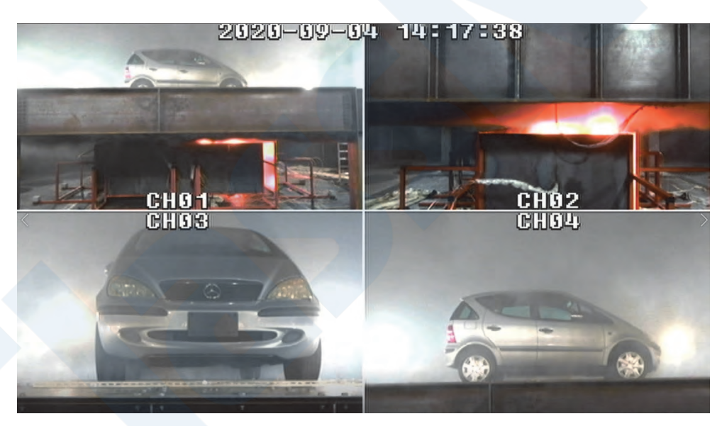
Figure 6 Photograph of vehicle fire experiment: Condition of vertical arrangement

The working group compiled the results as "Improvement measures for effective use of fixed foam fire-extinguishing systems." The Ministry of Land, Infrastructure, Transport and Tourism (MLIT) then issued a request dated June 10, 2021, to the Japanese Shipowners' Association to make further voluntary efforts for improvement of the safety of ships of large vehicle carriers by utilizing the improvement measures, and notified this to the registered ship classification societies, including ClassNK.