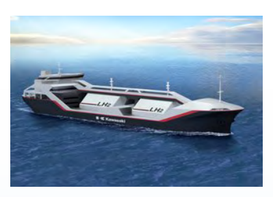
Kawasaki Heavy Industries design concept for an LH2 Carrier

focused on the hydrogen systems onboard, and how to build on experience with LNG carriers to develop viable LH2 cargo handling and cryogenic storage solutions in pressure vessel type cargo tanks with vacuum multi-layer insulation. Effective measures also need to be employed to reduce the possibility of leakage of hydrogen taking its high permeability into account.