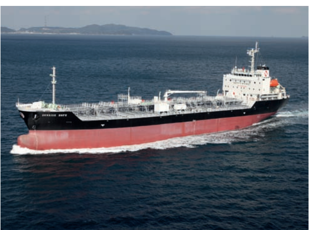
The 12,500MT chemical tanker Sunrise Hope

17 November 2014 - The world's first chemical tanker to use a combination of duplex stainless steel and stainless clad steel in the construction of its cargo tanks was successfully delivered to Oita-based Hiro Naviera S.A. on 15 November 2014 by Usuki Shipyard Co., Ltd. The application of the duplex steels in the vessel's cargo tanks was made possible thanks to an expansive joint research program involving steel manufacturers, leading technical universities, and ship designers, as well as ClassNK which supported the project as part of its Joint R&D for Industry Program.