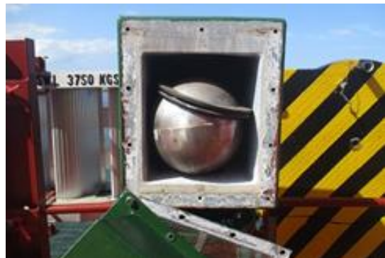
Gasket slipped off