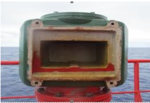
Missing disk and post

Examples of issues found are provided in the photographs below.