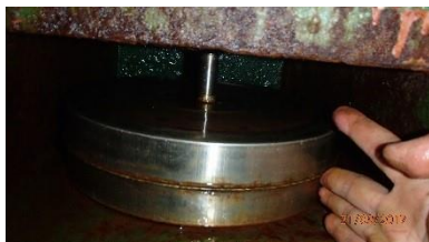
Broken Post/missing gasket