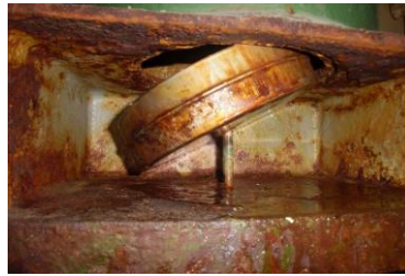
Post too short, disk slipped off