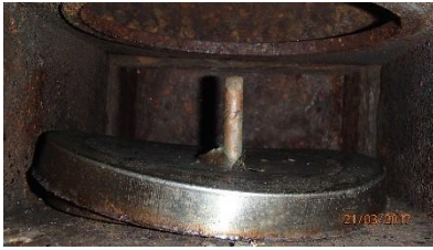
Warped Disk/Missing gasket

Examples of issues found are provided in the photographs below.