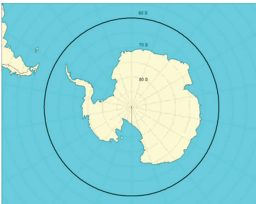
Figure 1 – Maximum extent of Antarctic area application 2