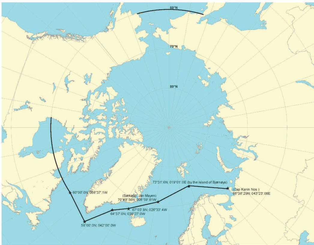
Figure 2 – Maximum extent of Arctic waters application 3