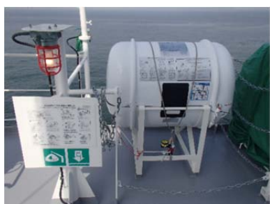
Davit Launched Liferaft

When replacing a liferaft, please confirm once again if the type of liferaft arranged by a serving firm is appropriate or not.